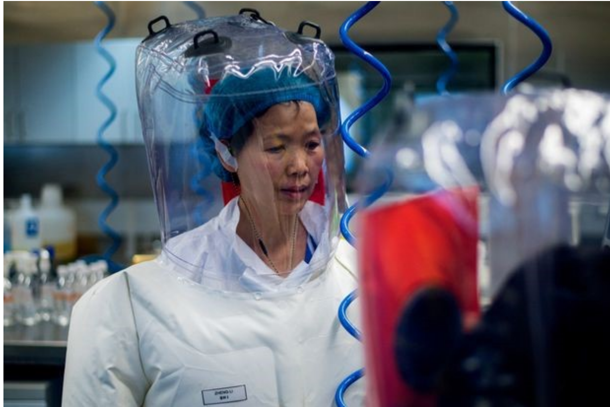
Dr. Zheng-li Shi in a high safety (level BSL4) lab. Her coronavirus research was done in the much lower safety levels of BSL2 and BSL3 labs.

Dr. Shi returned to her lab at the Wuhan Institute of Virology and resumed the work she had started on genetically engineering coronaviruses to attack human cells.